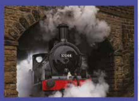
July & August