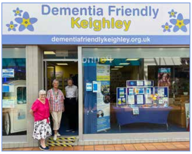
Dementia Friendly Keighley information and support centre is conveniently located in the Airedale Shopping Centre, Keighley, opposite PoundLand.